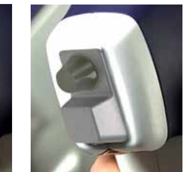
High Power handpiece