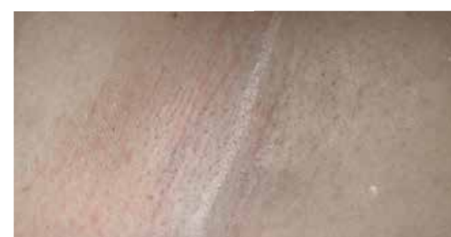
After 3 treatments