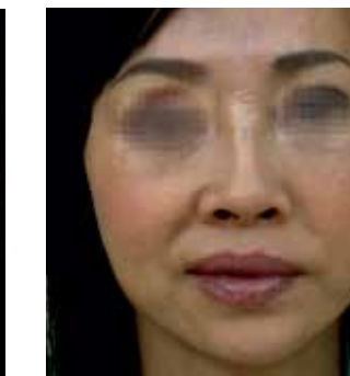
After 1 treatment