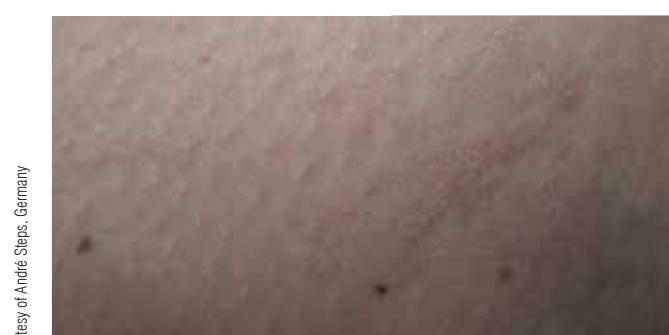
After 1 treatment