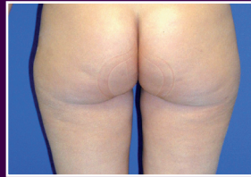
1 month after treatment